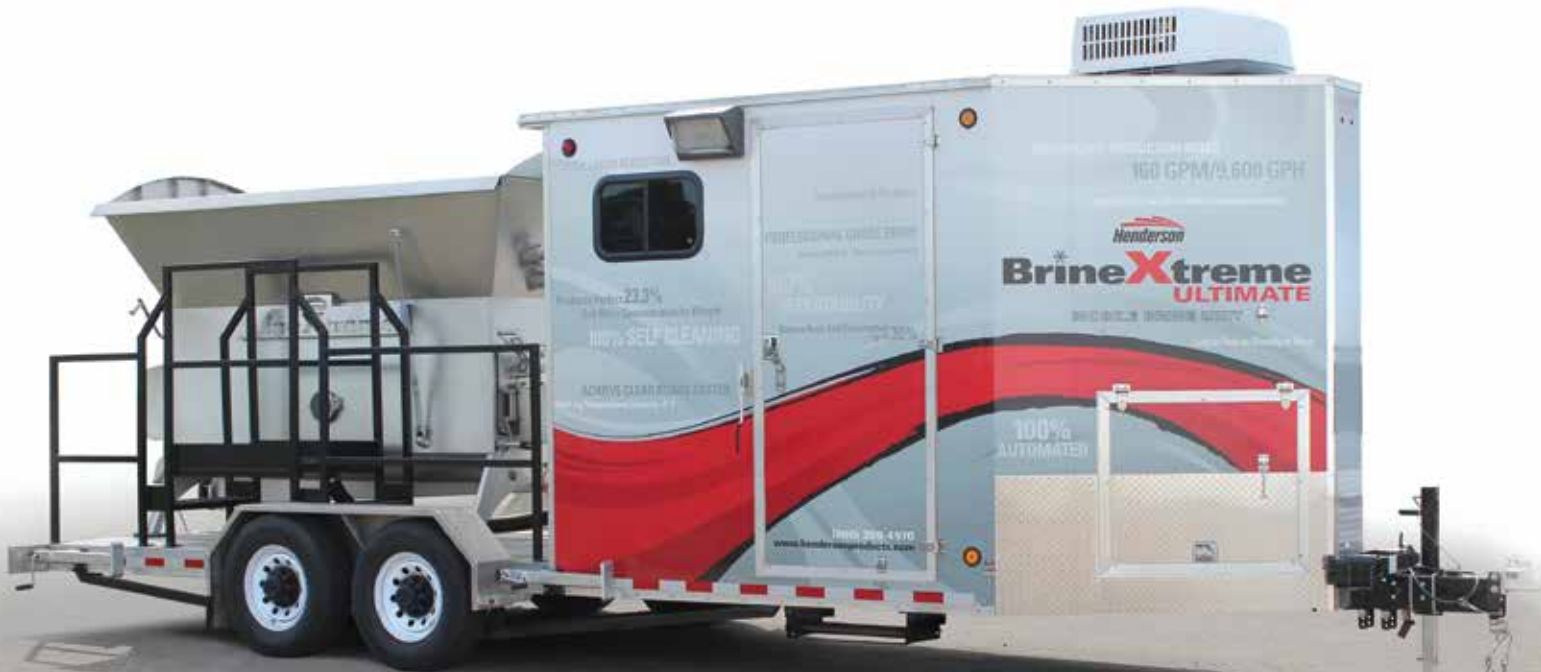
BrineXtreme Mobile Unit All photos shown with optional equipment.