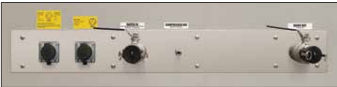
Exterior utility connections